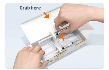
IMPORTANT: Always hold by the syringe barrel.

Place your finger or thumb on the edge of the tray to secure it while you remove each syringe. Grab the syringe barrel to remove the syringe from the tray.